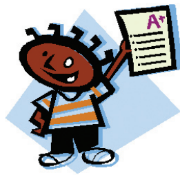
Asthma 411 Initiative